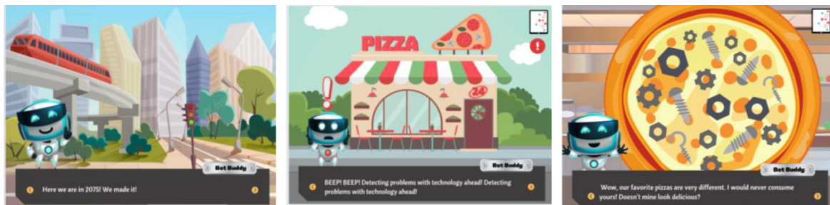
Figure 2: Scenes from level 1 showing a) agent and bot buddy in the future, b) the pizzeria and c) bot buddy, pizza output.

learning works. As part of the training in level 0, the agent receives a virtual S.P.O.T. tablet which is used to set up their agent profile and is loaded with tools that enable the child agent to communicate with the agency and access information that will be helpful on the journey. Two important tools accessible on the S.P.O.T. tablet are the travel journal and the megajoules meter . The megajoules meter shows a reading of the power usage on the time travel machine, which is powered by megajoules. To embark on their journey, children are given a head start of 100 megajoules, which is just enough to get them to the year 2075. However, they must earn more megajoules in the future by completing activities in order to return to the present world. The megajoules also serve the purpose of a reward mechanism that motivates students to complete more challenges in the game. The travel journal on the S.P.O.T. tablet allows users to provide audio narrations, text entries, or sketches to document their completed activities. Level 0 is completed when the child agent and bot buddy journey out of the present and into the future.