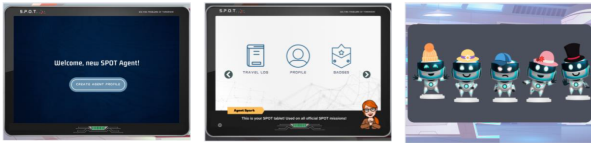
Figure 1: Scenes from Level 0 showing a) the new agent signup page, b) the tablet tools interface and b) bot buddy customization.